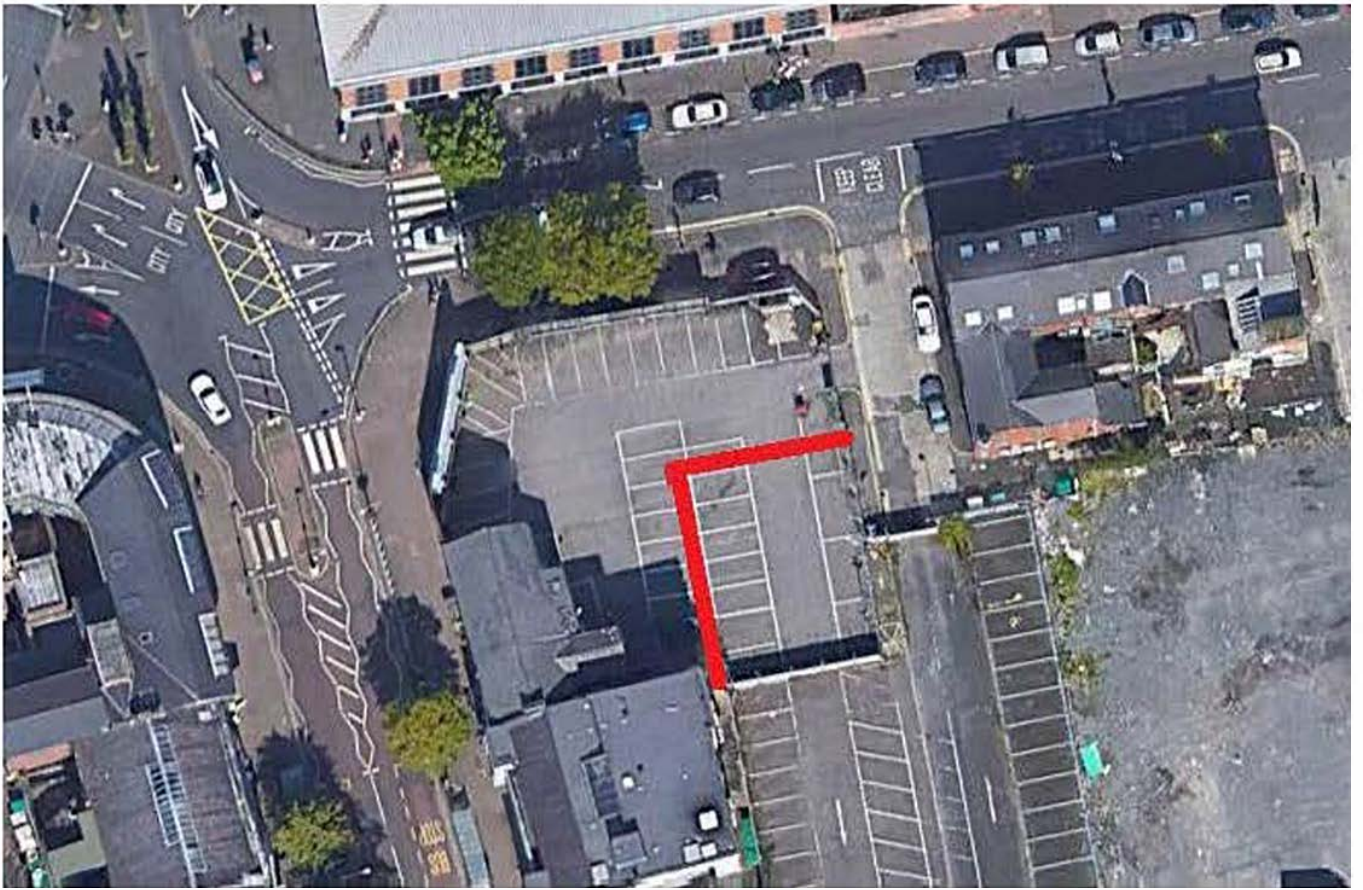
FOR INFORMATION - APPROXIMATE LOCATION AT BOTANIC AVENUE/DONEGALL PASS